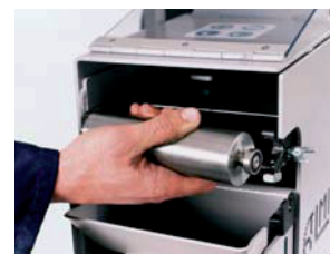
Grinding rollers are easy to change.