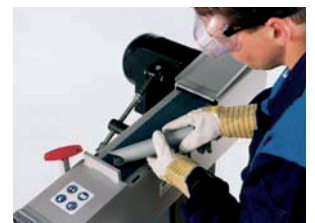
Provided with deburring table.