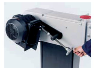
Grinding belt is quickly strained.