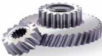
Typical parts produced on the GS:G 2 -LM