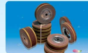
千页轮 Flap Wheel