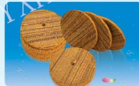
油麻轮 Jute Abrasive Wheel