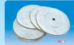
布麻轮 Cloth Jute Wheel