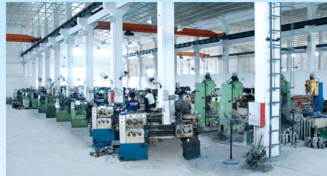
车间一角 Workshop Corner