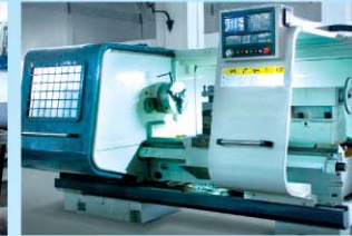
80数控车床 80 Numerical Lathe