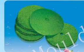
绿油麻轮 Green Jute Wheel