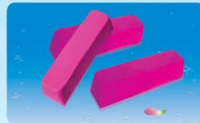
紫蜡 Purple Wax