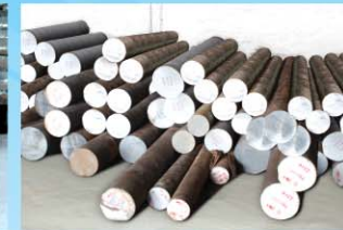
原材料仓库 Raw Material Warehouse