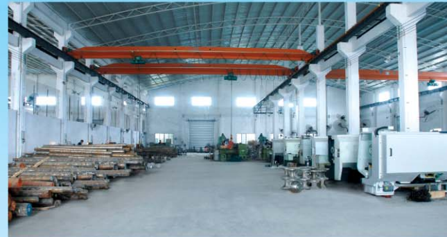
车间一角 Workshop Corner