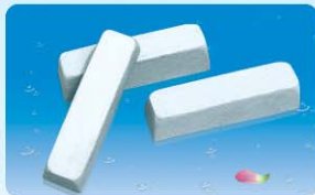
白蜡 White Wax