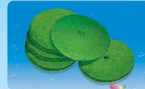
绿油麻轮 Green Jute Wheel