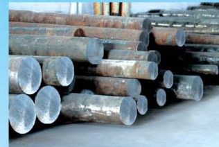
原材料仓库 Raw Material Warehouse