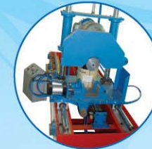
技术参数 Technical Parameters

It is easy to remove the sting of the pipe end, hydraulic driving to control up and down. It's the ideal cutting tool.