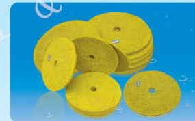
油麻轮 Jute Abrasive Wheel