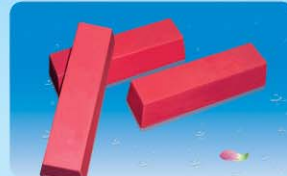
红蜡 Red Wax