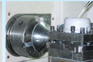
数控车床加工 Numerical Lathe Processing