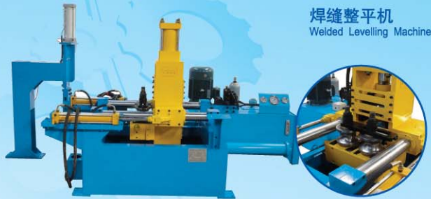
焊缝整平机 Welded Levelling Machine

焊缝整平设备是在线处理不锈钢焊管焊缝，同步对焊管内外焊缝反复碾压，使焊缝平滑与木材过筛，使有缝焊管无缝化更加突出焊管的优点。设备采用plc，比例液压自动控制，性能稳定，成材率高，安装方便，设置错误输出，和启动输入和制管生产线联动，是高级工业焊管必需的生产设备。