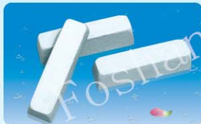
白蜡 White Wax