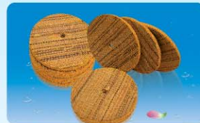
油麻轮 Jute Abrasive Wheel