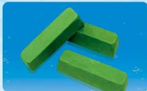
绿蜡 Green Wax