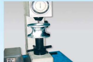
模具硬度检测 Mould Hardness Tester