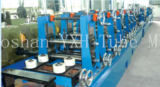
技术参数 Technical Parameters

Automatic production process:Decoller-Cleaning equipment-Feeding Direction-Forming-Welding-Internal Welding Leveling-Outer Welding Grinding-Shaping & Sizing-Solid Solution Treatment-Final Sizing-Straightening-Detection-Marking-Length fixing-Cutting-Unloading etc.