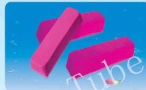
紫蜡 Purple Wax