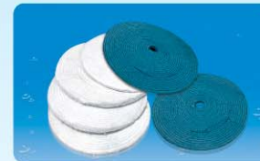
布轮 Cloth Wheel