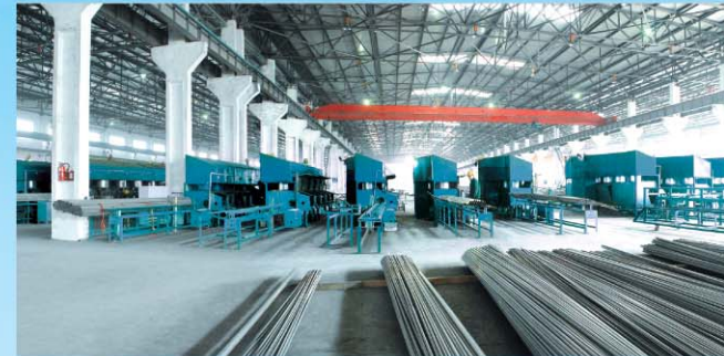
抛光机安排效果图 Polishing Machine Installation Effect Picture

This machine is used of foreign advanced technology, stainless steel, iron, aluminum tubes for a variety of processing. Machinable the scope of the diameter (Φ12-Φ114mm), thickness (0.3-2mm)