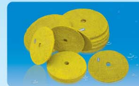
油麻轮 Jute Abrasive Wheel