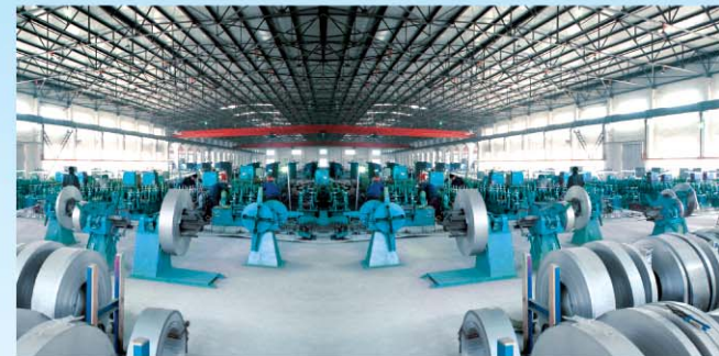
制管机安排效果图 Pipe Making Machine Installation Effect Picture