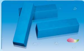
蓝蜡 Blue Wax

以进口高档布和国产优质布。采用自动化生产过程，所生产的绿油麻轮、白布轮、风布轮等耐高温，且在清除螺旋纹过程中，亮度和光洁度上会有更佳的效果。 千页轮以优质叶轮专用砂为原材料，厚度从8mm-700mm，粒度从240#-800#。 我们的产品广泛用于不锈钢管，铁管的磨削和抛光；还有五金、木材、塑料、陶瓷等抛磨行业。 Our products are extensively suitable for the grinding and polishing the stainless steel pipes, carbon steel pipes( iron pipes) as well as polishing and grinding industrial of hardware, wood, plastics and ceramics.