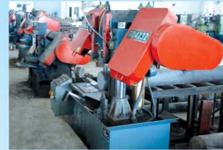
原材料切割 Raw Material Cutting