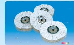
风布轮 Wind Cloth Wheel