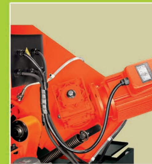
Reduction Gear Drive (for MH-210M / MH-270M only)