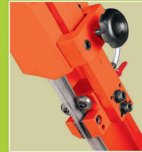
Blade Guide (for MH-210M / MH-270M only)