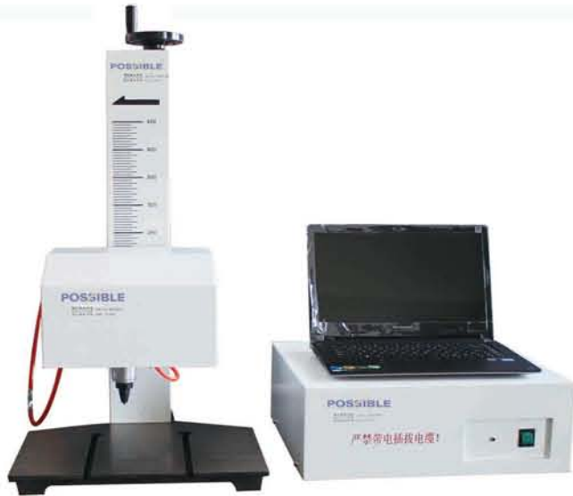
可选配件、工装: Optional accessories, fixtures: