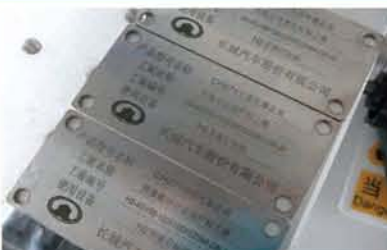
不锈钢 (Stainless steel)