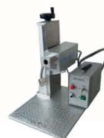
3W smallest mini type