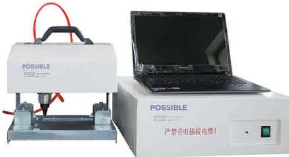
标记范围: 90*150mm (Marking Range: 90*150mm)