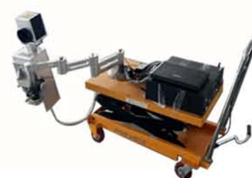
Movable cart type