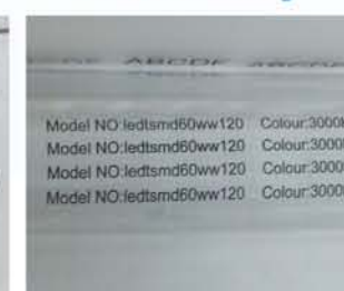
Transparent Plastic Tube