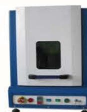
Mini type with protection cover