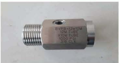
五金螺丝 (Hardware screw)