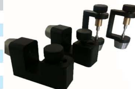
Diamond / Ring Fixture