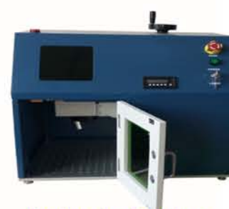
Enclosed cabinet type