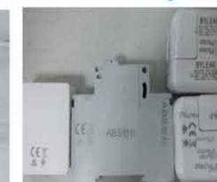
Plastic / ABS Marking