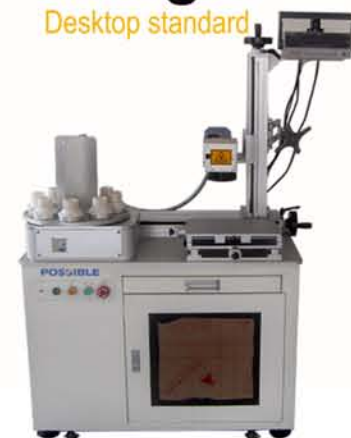
With LED fixture for LED marking