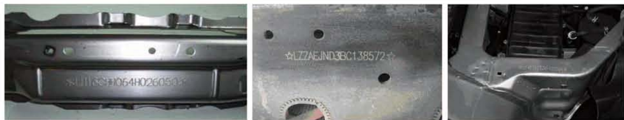
小轿车车架号 (Car chassis number)