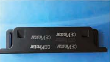
灯具外壳 Lamp fixtures