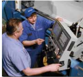
Dependable Service and Support