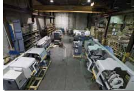
Schaumburg, IL facility with overhead Crane and stock of New Lathes