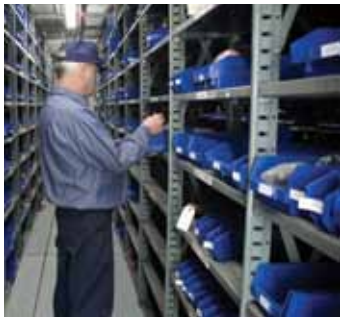
Thousands of Parts and Options