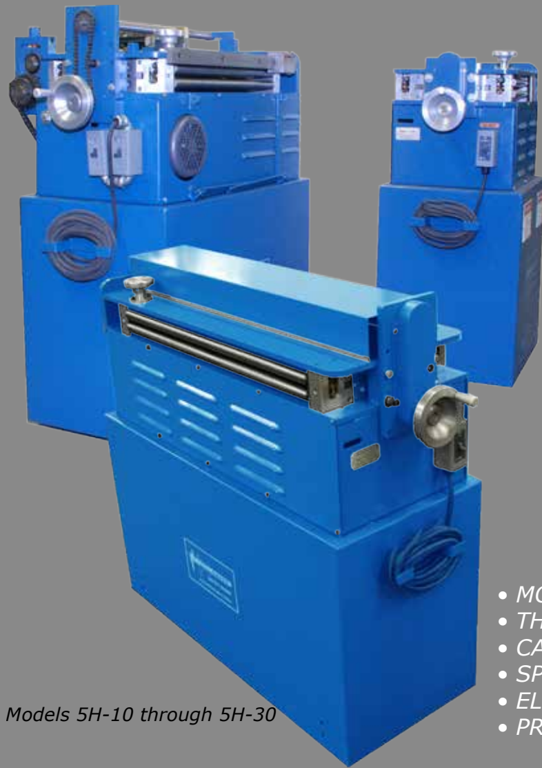
Models 5H-10 through 5H-30