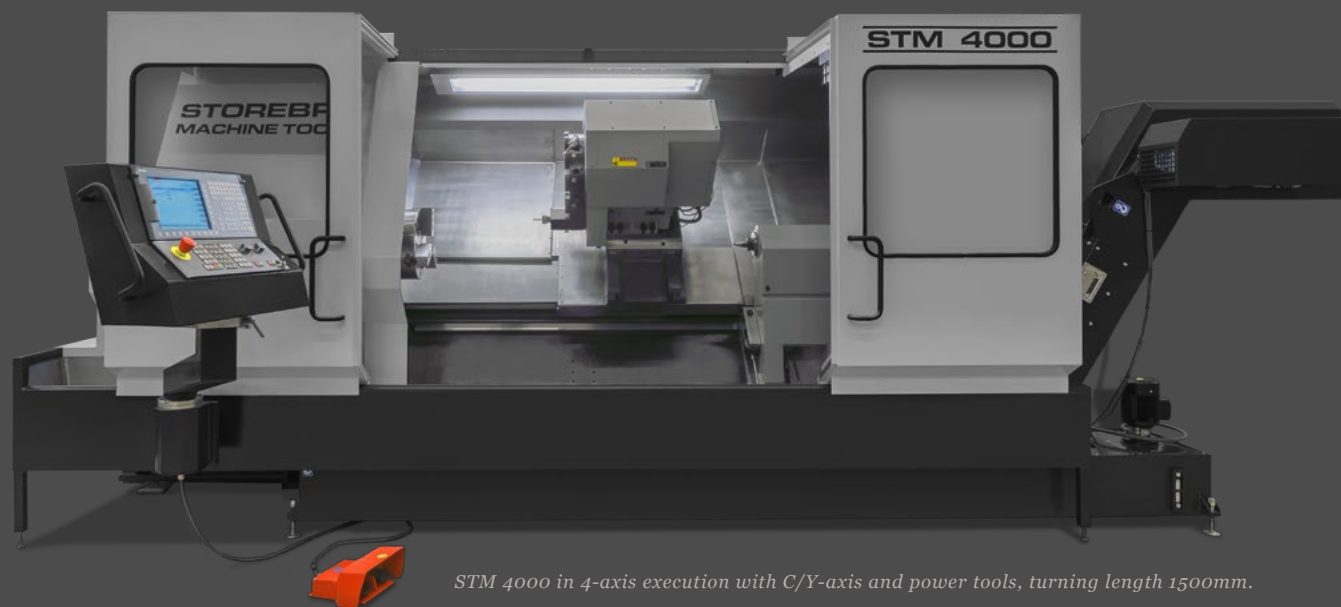
STM 4000 in 4-axis execution with C/Y-axis and power tools, turning length 1500mm.

Part catcher Automatic doors Work piece & tool probe High pressure coolant Grinding