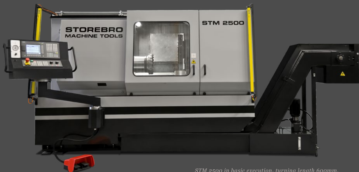
STM 2500 in basic execution, turning length 600mm.

Our CNC-Controlled Turning and Deep Hole Boring machines are constructed and developed together with the scandinavian industry to achieve high demands on effectivity, precision machining and long service life. All our products are possible to customize with different options, to meet specific demands to optimize Your production.