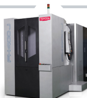
FH400J Horizontal Machine Starting at $224,000