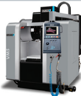
New VMXi Series