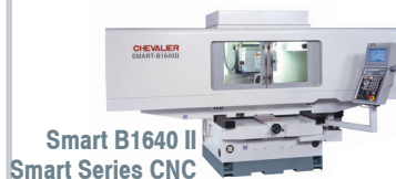
Smart B1640 II Smart Series CNC