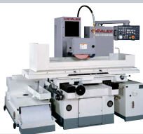
FSG 1224 ADV Hydraulic Grinders