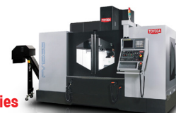
Vertical "FV" Series