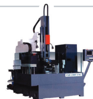
CNC Hole Drilling with Changer