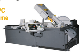
V18-APC Tilt-Frame CNC Saw