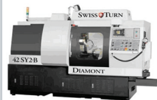
Eurotech Elite Swiss-Turn with B Axis