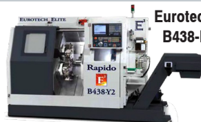
Eurotech Elite B438-Rapido