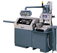
C350 CNC Cold Saw