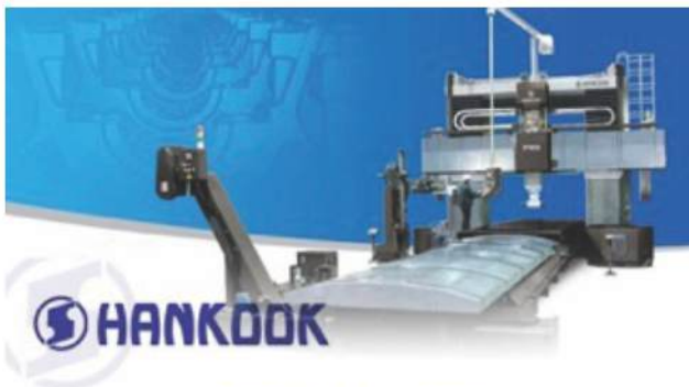
CNC Bridge Mill