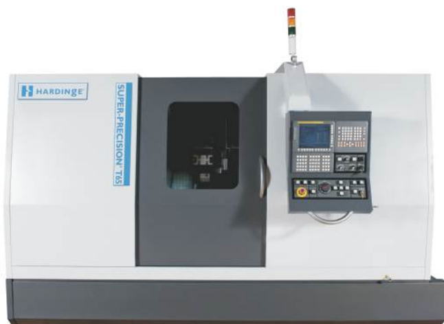
Super Precision T65

« Range : 480 mm x 330 mm – 1600 mm x 700 mm