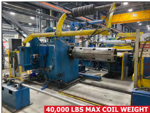
40,000 LBS MAX COIL WEIGHT