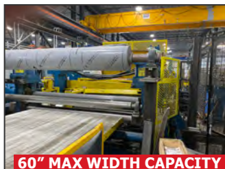
60" MAX WIDTH CAPACITY