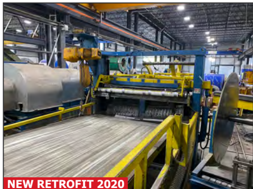
NEW RETROFIT 2020