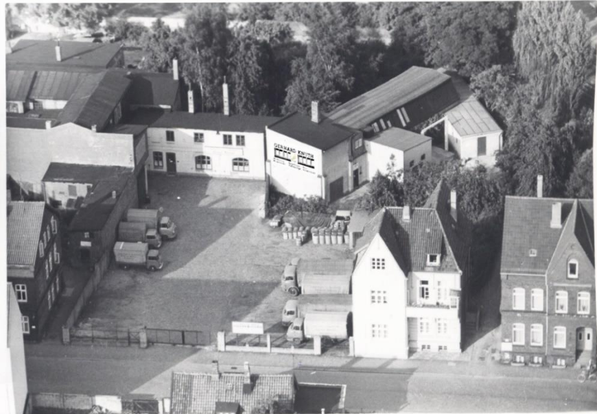
KNUTH Machine Tools – Circa 1947