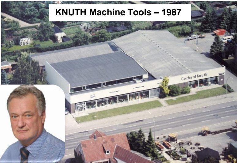
KNUTH Machine Tools – 1987