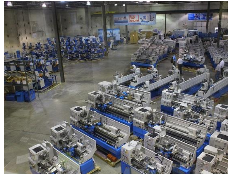
In-house inventory – machines for immediate delivery