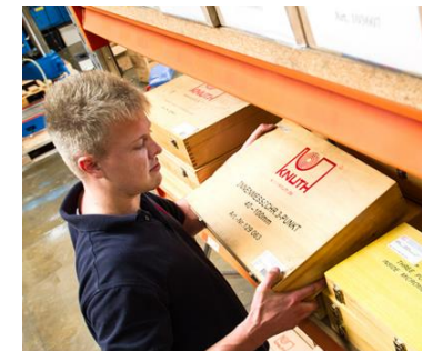
Spare Parts Inventory