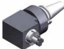
right angle milling head, 360° rotatable 7 031 ...