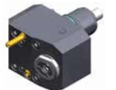
radial drilling and milling head, customized 8 039 ...