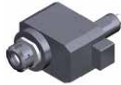
axial drilling and milling head, offset 8 019 ...