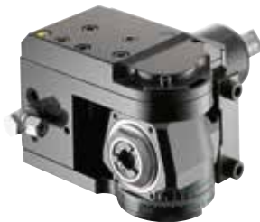
live tool unit, swivelling