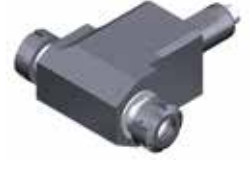
radial drilling and milling head, double spindle 8 039 ...