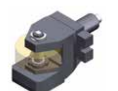
radial disc milling head 8 037 ...