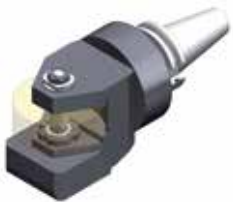
angle disk milling head, 360° rotatable 7 037 ...