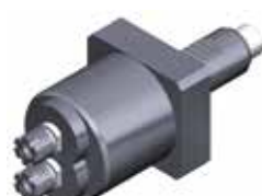
multi spindle drilling head 8 050 ...