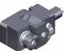
radial drilling and milling head, y-axis adjustable 8 038 ...