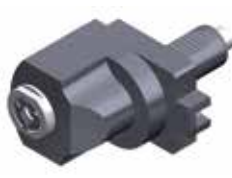
axial drilling and milling head, y-axis adjustable 8 018 ...