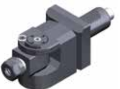
universal head 8 040 ...