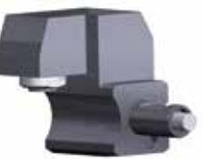
woodruff keycutter 8 037 ...