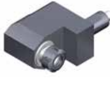
radial tapping head, offset 8 035 ...