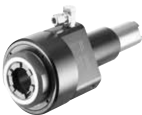
live tool unit, axial