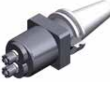
multi spindle drilling head 7 050 ...