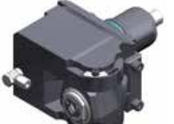
universal head, offset 8 043 ...