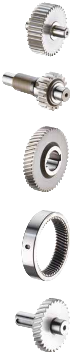
Possible types of manufacturable gears

As the range of production possibilities is growing, even components with complex interlocking can be produced on turning and machining centers. The complete machining process starts with milling and then the production of the teeth.