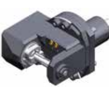
radial disc milling head, turnable 8 037 ...