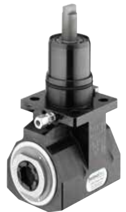
live tool unit, angled