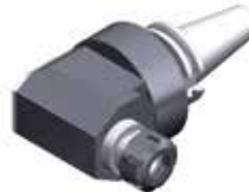
right angle tapping head, 360° rotatable 7 032 ...