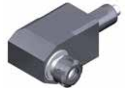
radial drilling and milling head 8 030 ...