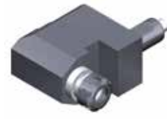
radial drilling and milling head, offset 8 033 ...