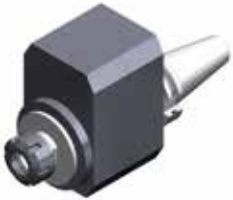
axial speed increasers/gear reducers 7 013 ...