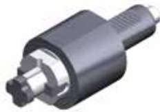
axial milling head 8 011 ...