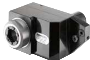
live tool unit, off-axis