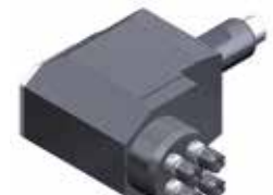
multi spindle radial head 8 053 ...