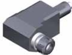
radial tapping head 8 032 ...