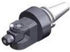
adjustable angle, 360° rotatable 7 040 ...