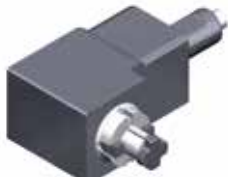
radial milling head 8 031 ...