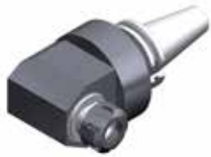
right angle drilling and milling head, 360° rotatable 7 030 .../7 039 ...