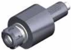
axial drilling and milling head 8 010 ...